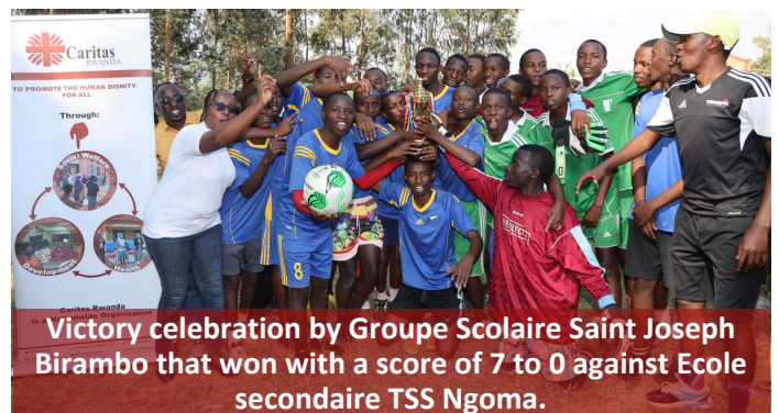
Victory celebration by Groupe Scolaire Saint Joseph Birambo that won with a score of 7 to 0 against Ecole secondaire TSS Ngoma.

In order to raise awareness about the significance of early HIV diagnosis, adherence to treatment, viral load suppression, and combating stigma and discrimination among adolescents in secondary schools, Caritas Rwanda conducted an awareness campaign calling the Karongi District in school students to do HIV voluntary testing, on 27 and 28 June 2024.