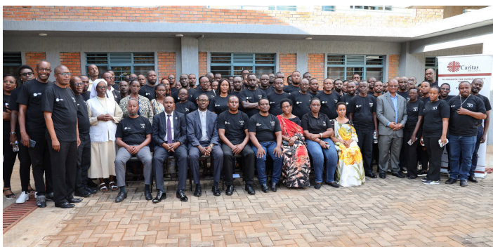
A souvenir photo, with the families of Caritas Rwanda staff killed in 1994 Genocide against the Tutsi

On 17th May 2024, Caritas Rwanda Management Team and staff gathered to honour the former Caritas Rwanda staff who lost their lives in the 1994 Genocide against the Tutsi. The commemoration included a requiem Holy Mass, the laying of wreaths at the Kigali Genocide Memorial and the sharing of messages of hope and testimonies.