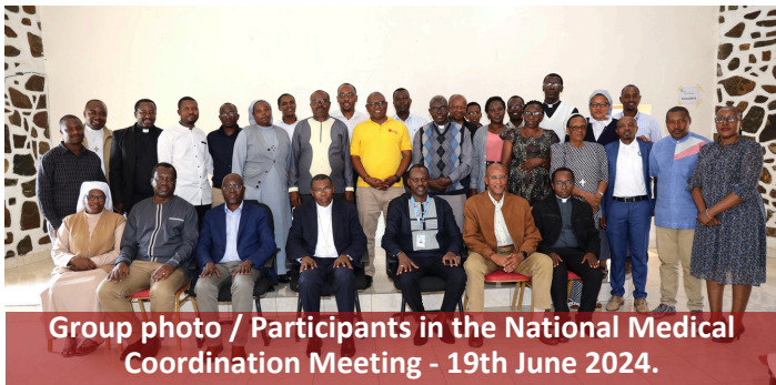
Group photo / Participants in the National Medical Coordination Meeting - 19th June 2024.

The Catholic Church Health Services National Coordination Meeting was held in Karongi from June 19 to 21, 2024. The primary goal of this meeting was to assess the progress of the Caritas Rwanda Strategic Plan 2020-2024 / Health and develop new health strategies to be included in the upcoming strategic plan for 2025-2030.