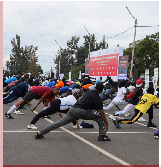
Physical activity / Tapis Rouge Nyamirambo