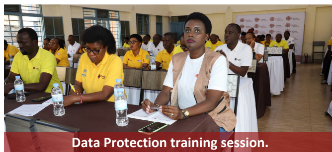
Data Protection training session.