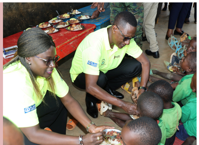
Providing children with nutritious meal / ECD Day Celebration - Bugesera.