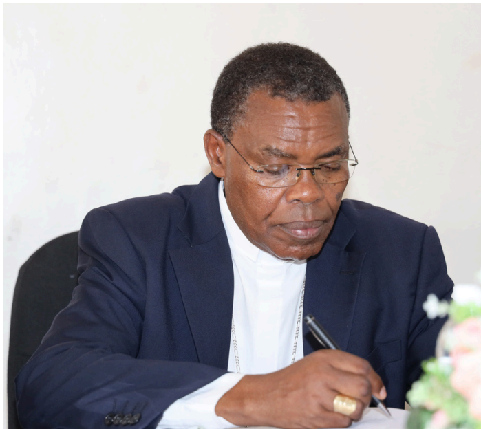
This meeting was opened by Bishop Anacleto Mwumvaneza, Bishop of Nyundo Diocese and President of Caritas Rwanda.

The Catholic Church Health Services National Coordination Meeting was held in Karongi from June 19 to 21, 2024. The primary goal of this meeting was to assess the progress of the Caritas Rwanda Strategic Plan 2020-2024 / Health and develop new health strategies to be included in the upcoming strategic plan for 2025-2030.