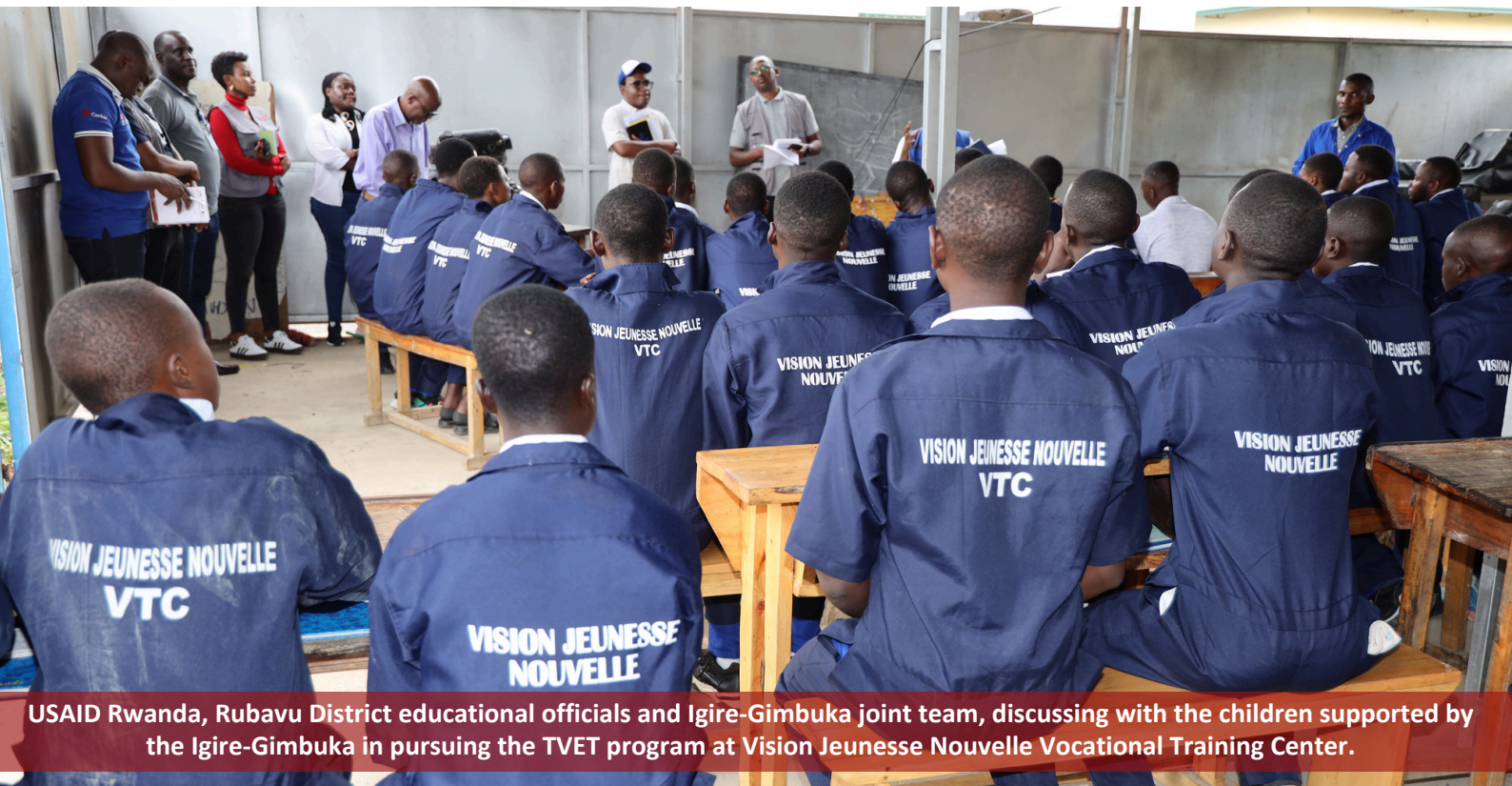
USAID Rwanda, Rubavu District educational officials and Igire-Gimbuka joint team, discussing with the children supported by the Igire-Gimbuka in pursuing the TVET program at Vision Jeunesse Nouvelle Vocational Training Center.