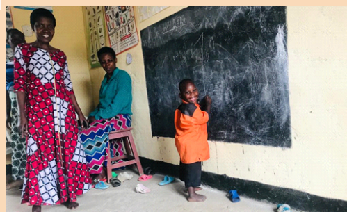
Nurturing care hub Itetero in Mpinga Cell, Shyira Sector Nyabihu District.