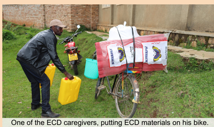
One of the ECD caregivers, putting ECD materials on his bike.