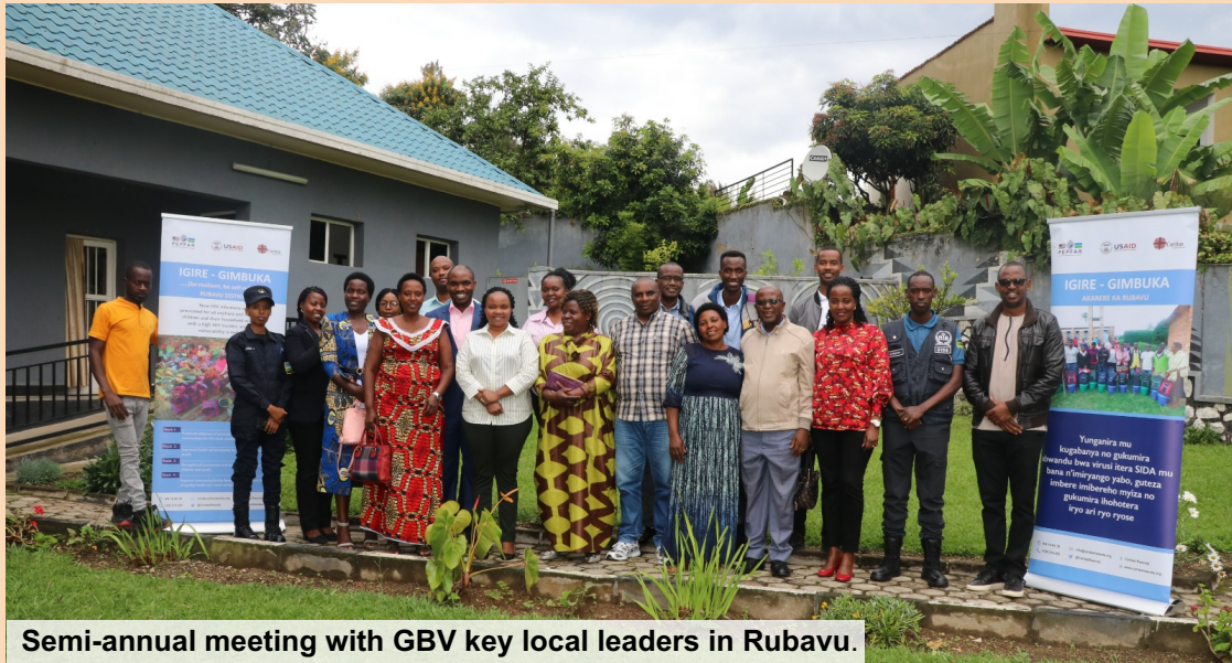
Semi-annual meeting with GBV key local leaders in Rubavu.

Caritas Rwanda through USAID IGIRE GIMBUKA Program organized semi-annual meetings with GBV key local leaders in Karongi, Nyamasheke, Rubavu and Rutsiro districts. The meetings held on 15 th , 16 th , 22 nd and 28 th March 2023 respectively.