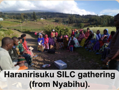
Haranirisuku SILC gathering (from Nyabihu).