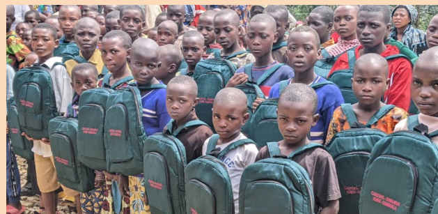
School materials distribution / Nyamasheke