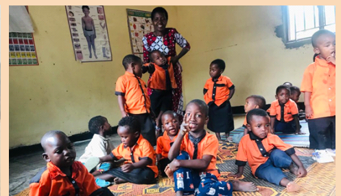
Children from Nurturing care hub Itetero in Nyabihu District.