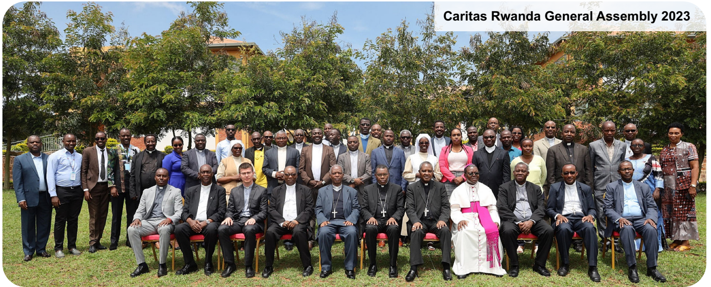
Caritas Rwanda General Assembly 2023