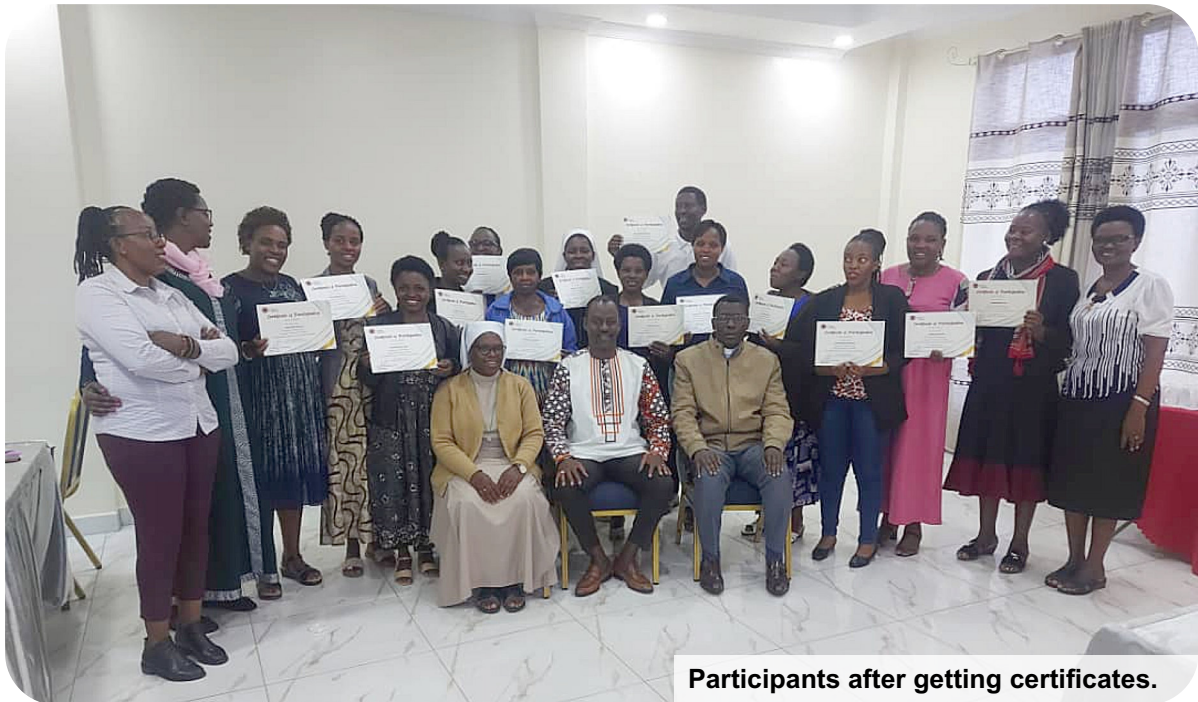
Participants after getting certificates.

In partnership with RBC/ Enabel, Caritas Rwanda has conducted a ten-day Training of Trainers for 10 participants selected in the Catholic based Health Facilities offering Natural Family Planning services whereby each Diocesan Caritas has been represented by one (1) NFP service provider at Health Center level. In total, 14 participants have attended it (including 4 staff from Caritas Rwanda/Health Department/NFP). The training held at Fatima Hotel, in Musanze District, from 20 th to 31 st March 2023.