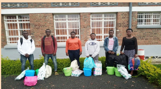
School materials distribution / Rubavu

In accordance with the PEPFAR enrollment criteria, priority was given to Children/Adolescents Living with HIV, People Living with HIV, GBV survivors, HIV Exposed Infants, Children whose biological parents are HIV positive, and children of female sex workers. In addition, special care has been taken to ensure that the intervention is gender-responsive and inclusive, with children with disabilities enrolled if they meet the eligibility criteria.