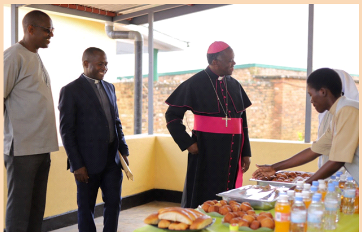
Visit to the Incubation Center's bakery.