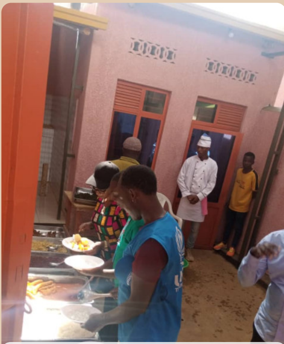
Joint monitoring team visiting restaurant of 4 Graduation beneficiaries graduated in culinary arts.

With the aim of continuous capacity building of field agents and reporting of achievements, three review and reporting meetings re-organized on a monthly basis to maintain the functionality and boost the multiplication of IGAs. From January to March 2023, nine monthly meetings have been organized in Burera, Rurindo and Nyabihu involving all 164 FAs and 41 PSP. The meetings were also an opportunity to document the progress on last meeting's actions, key challenges encountered, and lessons learned.