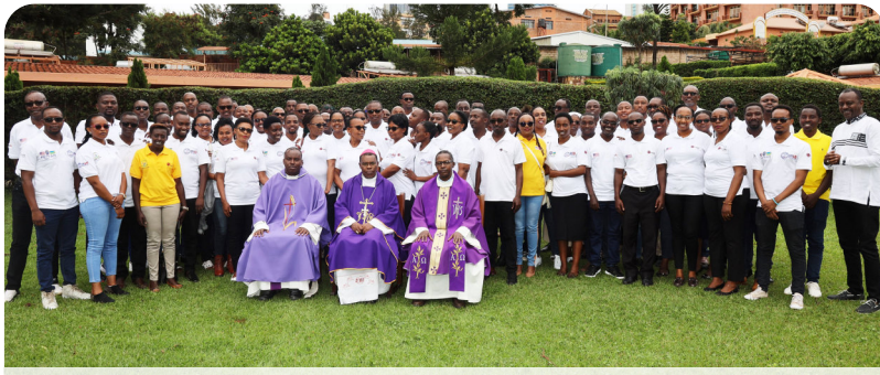
Farewell ceremony of Mgr JMV Twagirayezu (March 24, 2023).