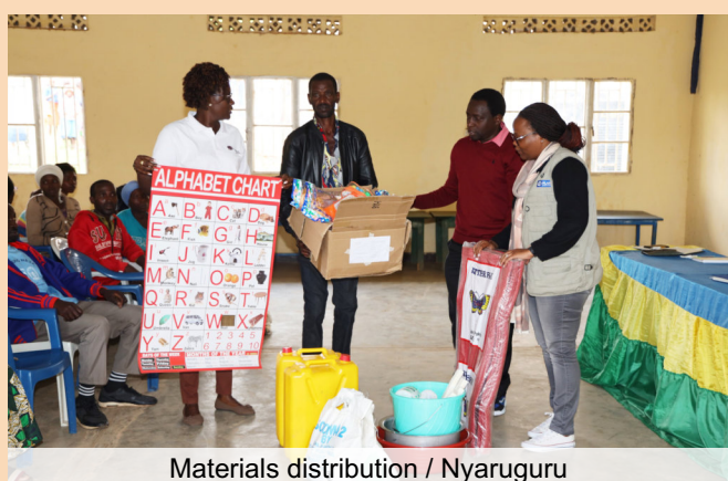
Materials distribution / Nyaruguru