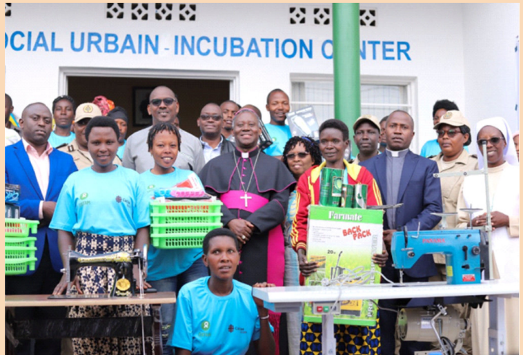
Inauguration of the Caritas Byumba's incubation center, on January 16, 2023.

The incubation center comes as a polishing instrument to concretize the works done in correctional centers so that the graduates out of them can play their rightful roles in society as well as enabling access to the public on the commodities being fabricated in the correctional centers. Following are its objectives :