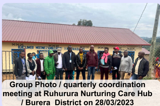
Group Photo / quarterly coordination meeting at Ruhurura Nurturing Care Hub / Burera District on 28/03/2023