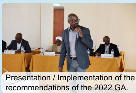
Presentation / Implementation of the recommendations of the 2022 GA.