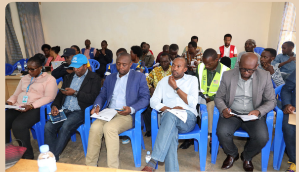
Participants in the Kiziba orientation meeting.

On January 19, 2023, Caritas Rwanda, through the Graduation project (funded by UNHCR), had an orientation meeting with its stakeholders in Kiziba Refugee Camp (in Karongi District) to discuss the 2020-2022 key achievements and the 2023 action plan.