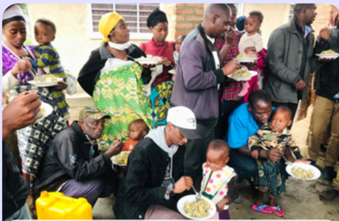
Twiyubake group members feeding their children after a health diet cooking demonstration session.

The Papa lumière coached his comrades on VNS methodology and asked the field agent operating in Bukinanyana cell to organize a session on SILC methodology as promoted by GKB. The group started contributing for foods commodities for VNS monthly cooking demonstration and they even regularly participate. The group undertook SILC activities in September 2022 and as today, their saving is elevated to Frw 311,600, Social funds of Frw 65,550 and total loans of Frw 402,700. Members we able to run small business which transformed positively household economic lives (many HHs have bought small animals like sheeps ,,..) and they all started to actively contribute in their children' nutrition, health and education. Moreover, the group is actively contributing to the establishment of kitchen gardens in all households.