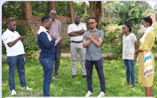
Igire-Gimbuka Program field staff during a MHPSS scenario.