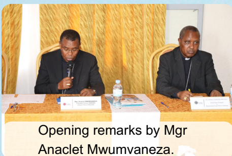
Opening remarks by Mgr Anacleto Mwumvaneza.

Among the recommendations of the General Assembly in regard to Caritas Rwanda is the harmonization, coordination and strengthening of the voluntary system by emphasizing the mobilization of youth, the collaboration between the Episcopal Commission in charge of health care, the strengthening of the collaboration and synergy between Caritas Rwanda, the Episcopal Commission in charge of the family and the National Service for Family Action (SNAF), as well as revitalizing the development activities and supporting the Diocesan Caritas in this sector.