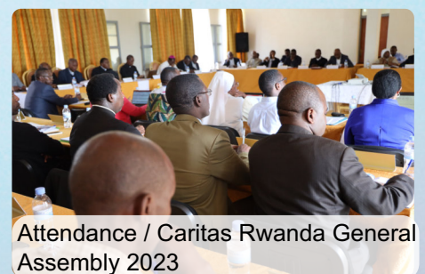
Attendance / Caritas Rwanda General Assembly 2023