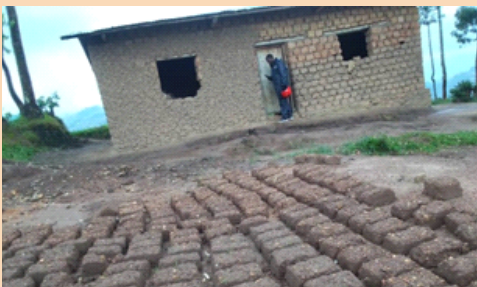
Gatovu Nurturing Hub before its renovation with the GKB Financial support.

All those Nurturing Care Hubs are the results of combined efforts by Community contribution and the financial support from Gikuriro Kuri Bose Program (implemented by Caritas Rwanda and funded by that allowed to renovate unfinished and unsafe facilities up to modern community ECD with 2 classrooms; improved kitchens, latrine blocks and offices of the head of village. Some of them have been equipped with essential ECD equipment and caregivers have been trained to offer high quality early child development services.