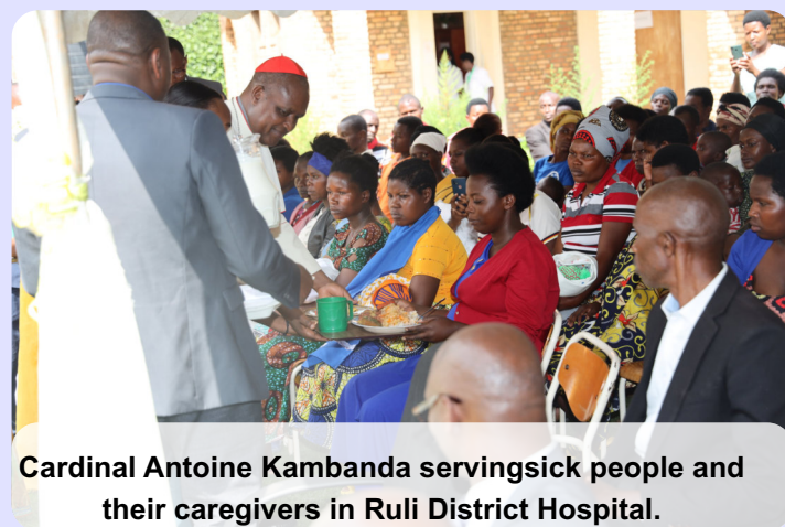
Cardinal Antoine Kambanda serving sick people and their caregivers in Ruli District Hospital.

The event started with a Holy Mass celebrated in the parish of Ruli, by His Eminence Antoine Cardinal Kambanda. In his homily, he referred to the message of His Holiness Pope Francis for the World Day of the Sick 2023, under the theme: "Take care of him" . We find this passage in the Gospel of Luke 10:35, where the Samaritan showed compassion by taking care of a person who had been robbed and injured by thieves, unlike the priest and the Levite.