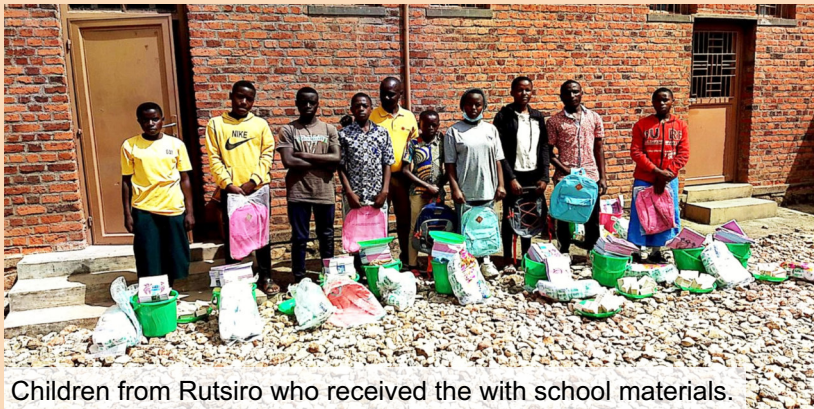
Children from Rutsiro who received the with school materials.