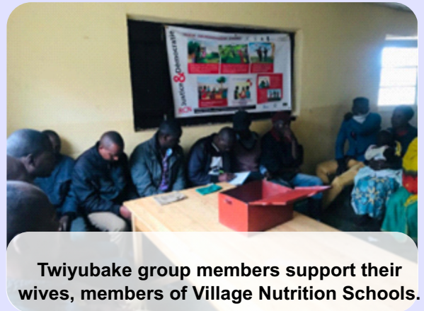
Twiyubake group members support their wives, members of Village Nutrition Schools.

Twiyubake is a father support group in Nsakira Village, Bukinanyana Cell, Jenda Sector in Nyabihu District that, after mobilization by GKB, was established in September 2022 by a group of men intending to support their wives, members of VNS and SILC group in the village to offer quality integrated ECD and nutrition services to their children. The group is made of 30 men meeting every week for SILC and food security activities as well as participating in monthly cooking demonstration and parenting sessions along with their wives.