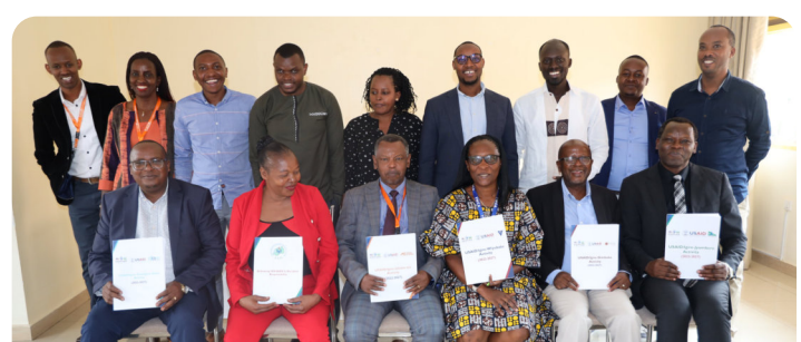
24/02: MoU was signed between Caritas Rwanda and other USAID/Igire IPs with RRP+, in bid to join hands for serving people living with and affected by HIV.