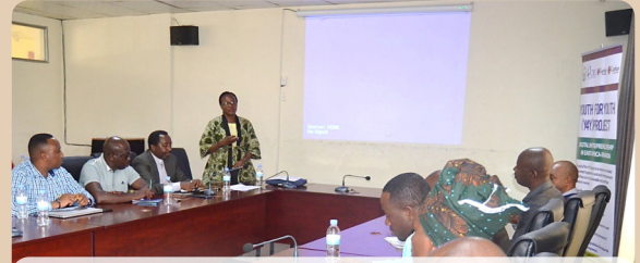
Nyabihu introductory meeting.

From 13th to 17th February 2023, held the Districts-level Introductory meetings to introduce the project and its interventions in this fiscal year of 2022/2023.