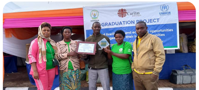
23/02: Caritas Rwanda through the Graduation Project was awarded as the 2nd exhibitor among local NGOs, in Kirehe Open Day FY22-2023