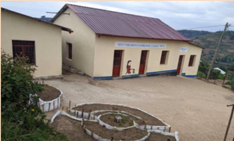
Gatovu Nurturing Hub located in Gatovu Village, Rugali Cell, Rwerere Sectors in Burera District accommodates 55 children.