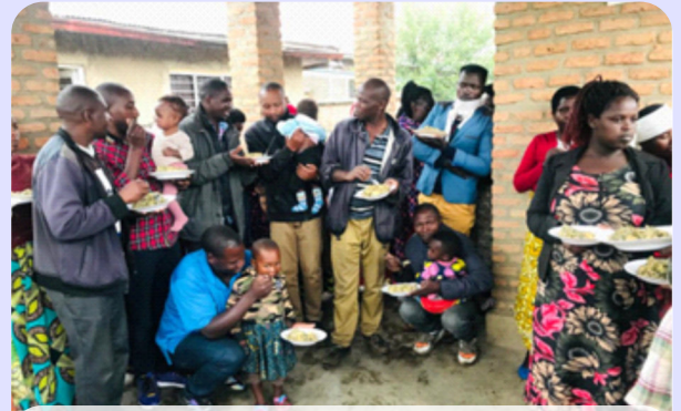
Twiyubake a group of men intending to support their wives members of VNS.

There are 1075, 937 and 754 Village Nutrition Schools (VNS) groups established by Gikuriro kuri Bose in Burera, Rulindo and Nyabihu Districts respectively and 1140, 988 and 914 Parents Lumières in Burera, Rulindo and Nyabihu Districts respectively have been trained to lead nutrition activities in villages by working closely with CHWs and other community volunteers to ensure and maintain VNS groups' dynamisms and functionality. During VNS sessions, usually organized once or twice a month, the mothers, who bring their children under five, take part in cooking demonstrations, nutrition counseling, and child growth monitoring. With the aim of continuous capacity building of PLs and reporting of achievements, 168 review and reporting meetings (21 in Rulindo, 19 in Burera and 2 in Nyabihu) rotationally involving one PL per village are organized on a monthly basis to maintain the functionality.