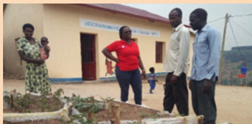
Gatovu ECD representatives explaining how they work to maintain the kitchen gardens for balanced diet.