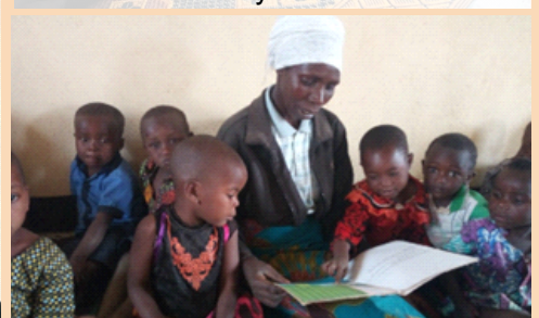
The caregiver from Gatovu Nurturing hub reading stories for children.