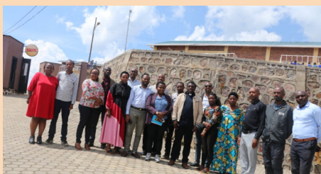
GBV key local leaders meeting in Rutsiro.

The participants advise also to educate youth on how technology can be used for good not for bad things and mobilize community members and GBV survivors to report perpetrators on time and report to the right person (RIB and Isange One Stop Center) and try to preserve evidences.