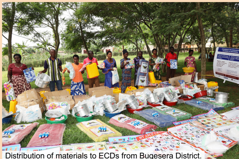
Distribution of materials to ECDs from Bugesera District.

The ECDs that have received these materials are home, school and community-based. There are 50 in Gatsibo district, 188 in Nyaruguru district and 20 in Bugesera district. They make a total of 258 ECDs.