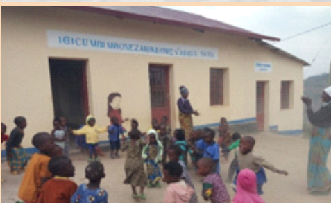
Gatovu Nurturing Hub after its renovation.