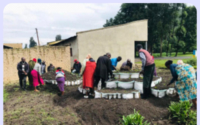
Twiyubake group members working in vegetable garden with their wives.