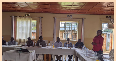
GBV key local leaders meeting in Nyamasheke.