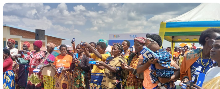
International women day celebration: Caritas Rwanda through Igire-Gimbuka Program donated phones to 75 women to help them access technology.