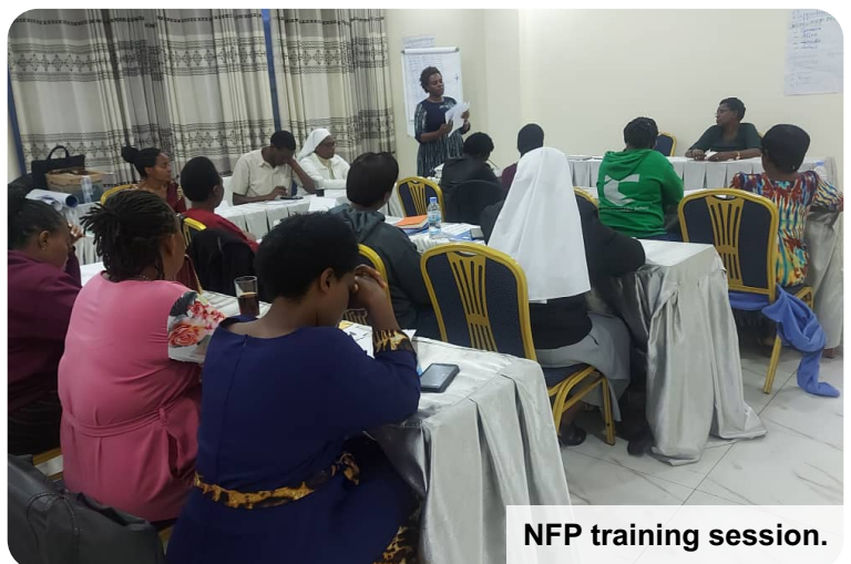
NFP training session.

Briefly, based on their scores in pre and post-test, we can conclude that there was an improvement in knowledge considering the increase in the post test results compared to the pre-test for each participant. Also, the entire team's mean score that has progressed from 83% (in pre-test) to 93% (in the post test) indicates that the training has been conducted successfully.