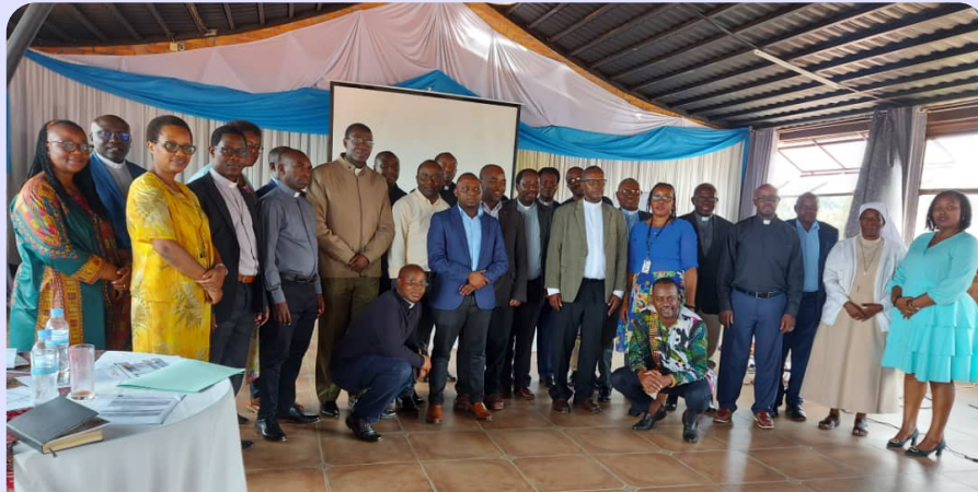
Group Photo captured at the end of the Mid-term evaluation meeting of the Family Action Strategic Plan (2019-2024) on February 27, 2023.

On 27th February 2023, Caritas Rwanda through the Health Department and National Family Action Secretariat held a mid-term evaluation meeting of the Family Action Strategic Plan (2019-2024), which was inaugurated by His Eminence Antoine Cardinal Kambanda.