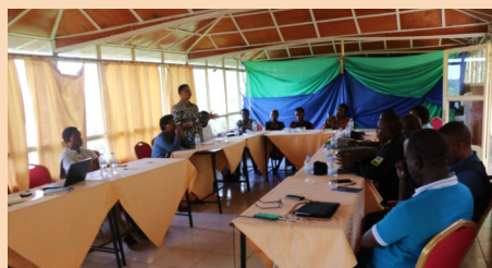
GBV key local leaders meeting in Karongi .